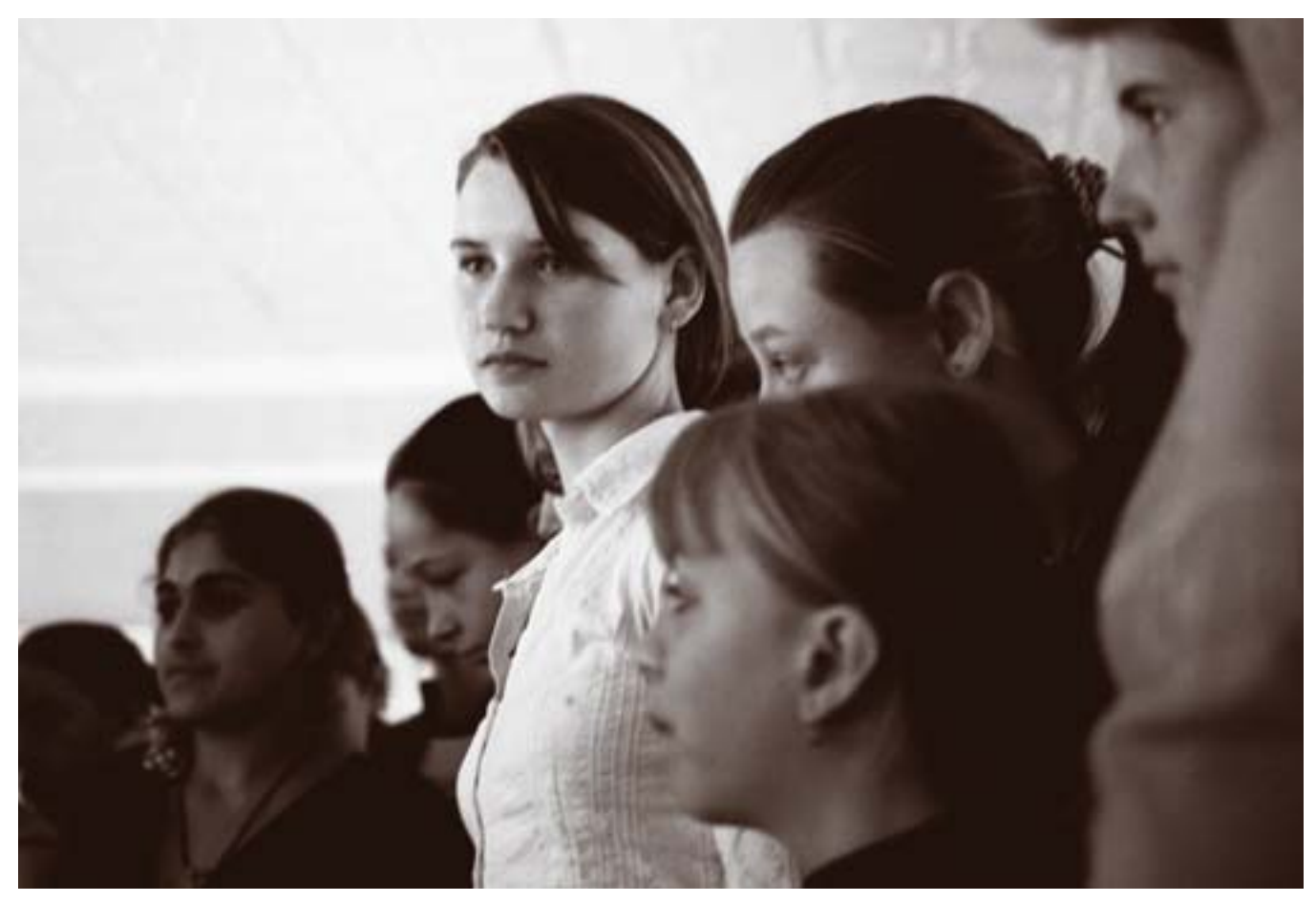
🔺 Teenage girls at a 'boarding school' or orphanage for abandoned children in Moldova. These children are seen as being the most vulnerable to traffickers.

depression that often ensues, but also social stigma especially in cases of sexual exploitation.